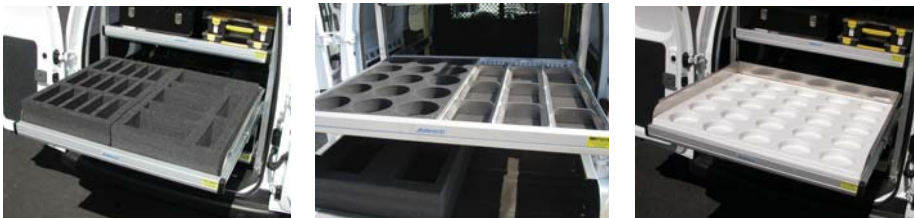
Several inserts are available to keep things in place.

Contact your Dejana Sales Rep for more info: