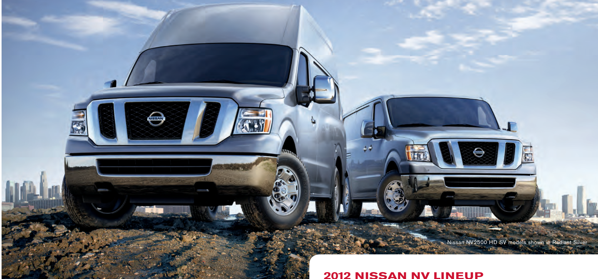
Nissan NV2500 HD SV models shown in Radiant Silver